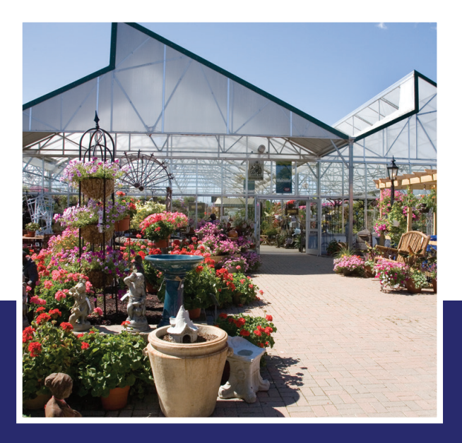
These Zail greenhouses at Hoerr Nursery feature vertical ridge and side/endwall vents to save energy costs.

A single Atrium™ greenhouse with a brick knee wall and specialty end truss provides a focal centerpiece at Linton's Enchanted Gardens. Matching finials sit atop the greenhouse and the entrance cupola, blending the buildings together and complementing the weather vane.