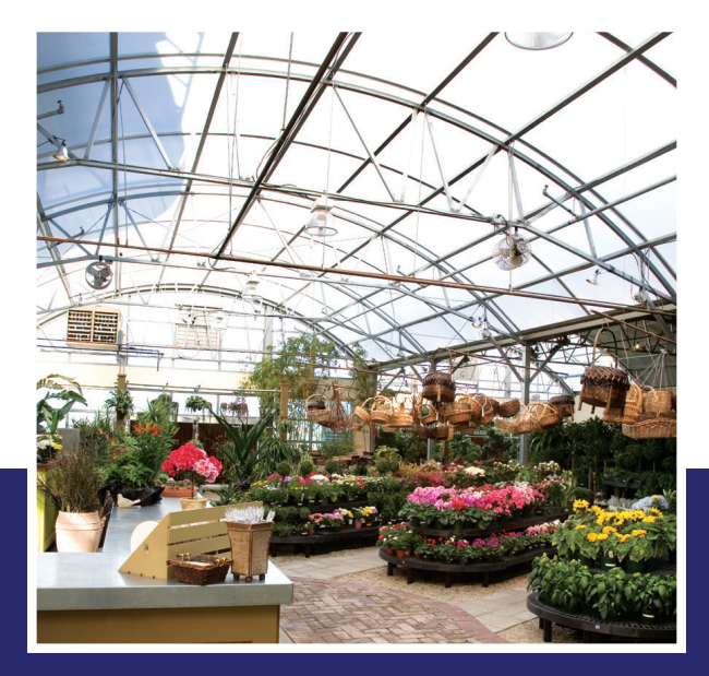
Under a curved gothic roof, the checkout counter at Cactus & Tropicals blends seamlessly with the retail shopping environment.