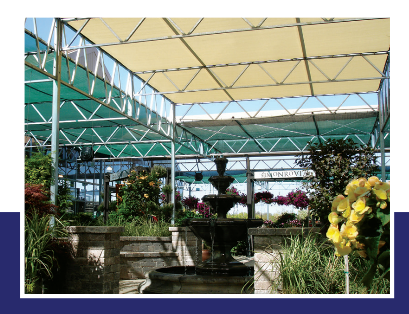
Ladder bar trusses at Plymouth Nursery support flat shades to protect shoppers, plants and hard goods from direct sun or inclement weather.

Our expertise doesn't end at the greenhouse structure. Our equipment line includes benching, ventilation, irrigation and more—everything needed to make your greenhouse complete.