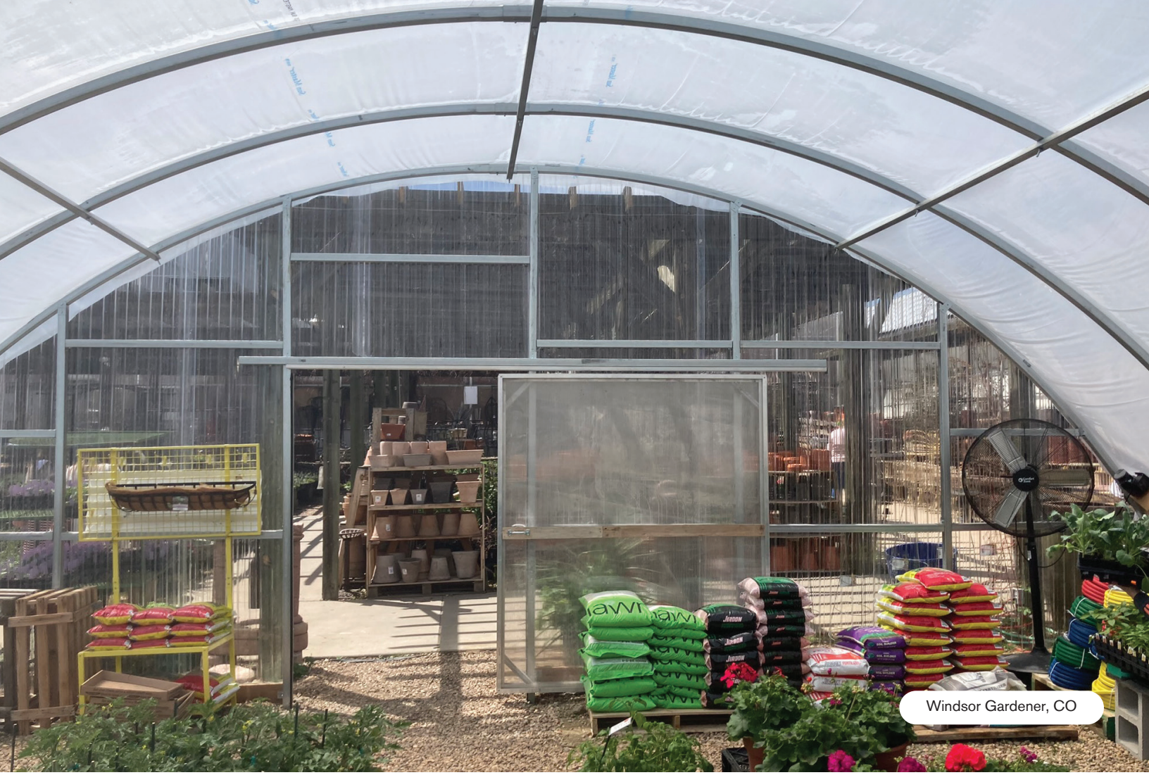
Windsor Gardener, CO