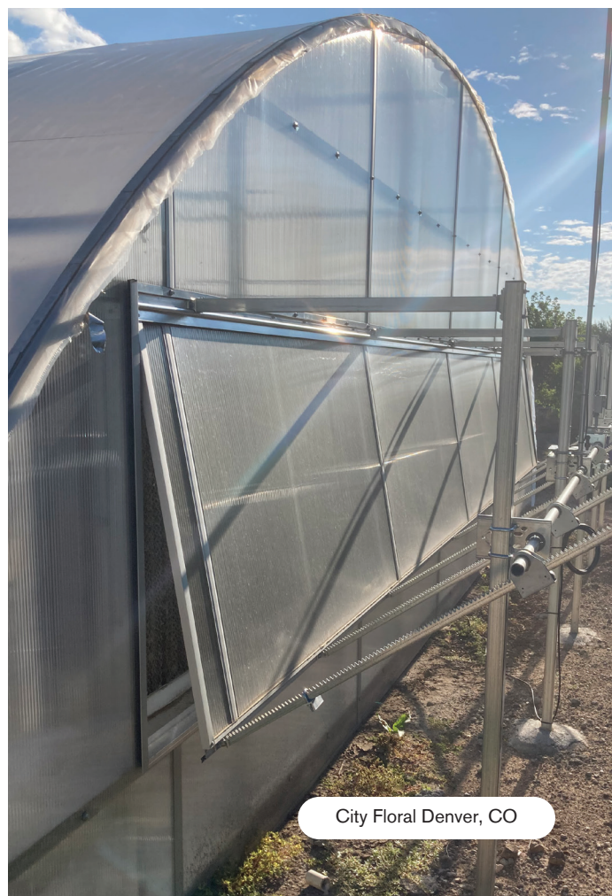
City Floral Denver, CO