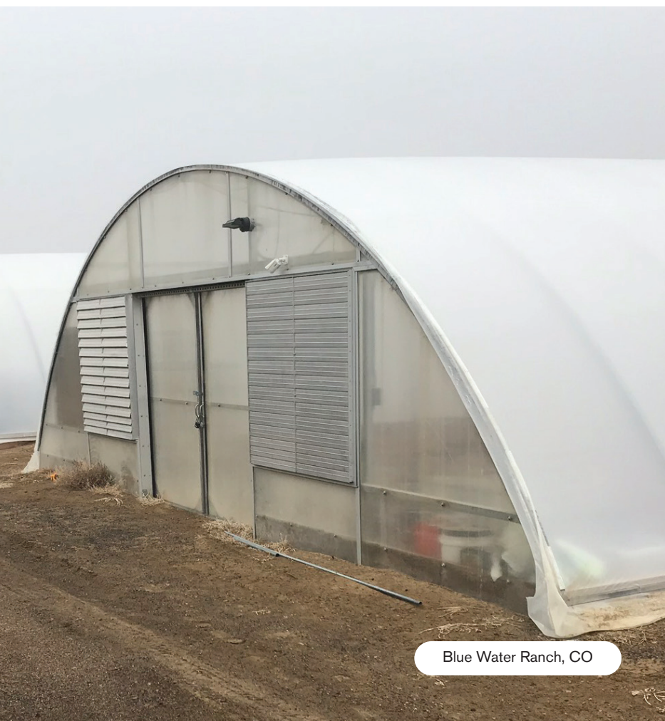
Blue Water Ranch, CO