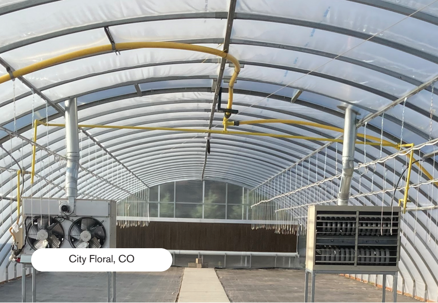
City Floral, CO