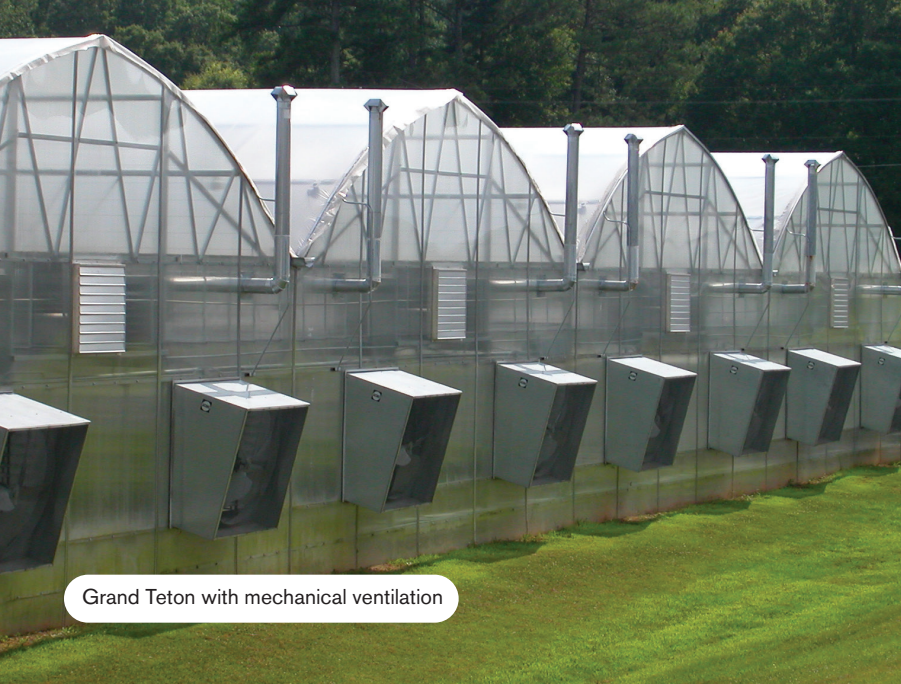
Grand Teton with mechanical ventilation