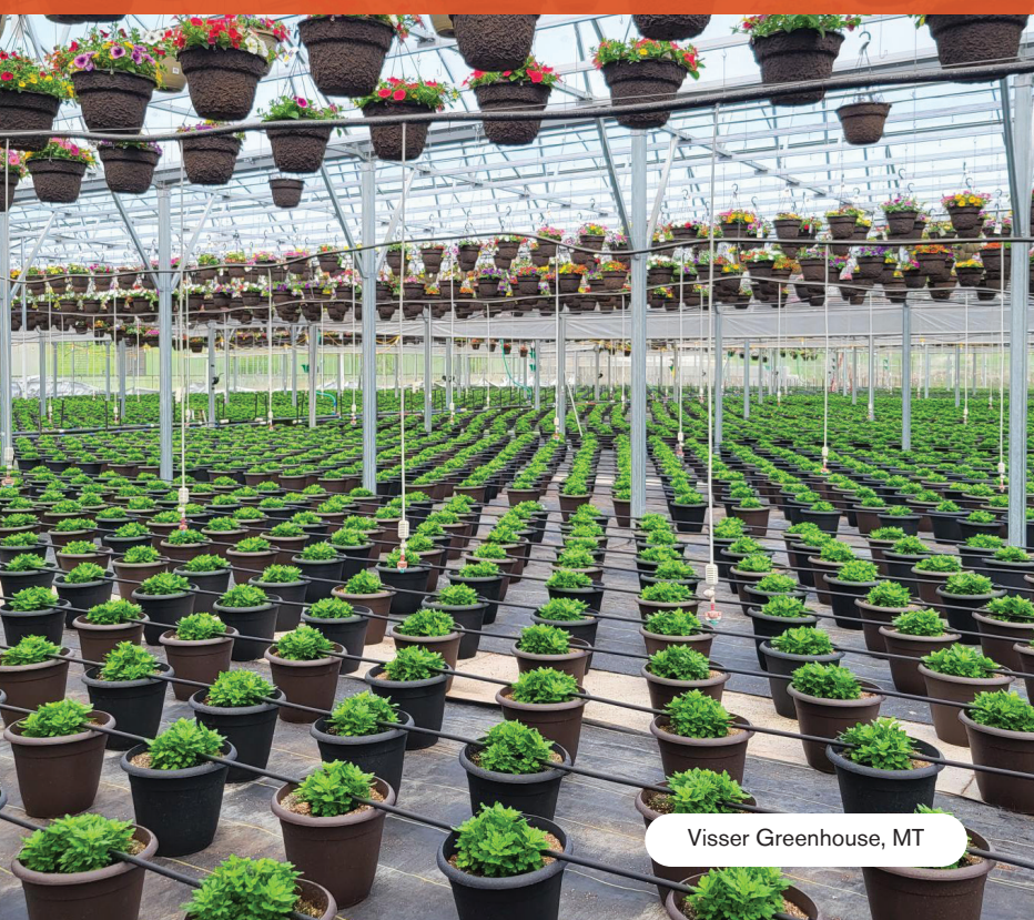
Visser Greenhouse, MT

The Grand Teton makes for a great production greenhouse with high overhead clearance that offers ample space for suspended equipment and hanging baskets. As climate change poses challenges to passive growing, this house is the ideal solution for growers seeking a pad-wall and fan style growing environment. The Grand Teton also offers exceptional insulation, making it a smart choice for growers in colder climates and for those who want to start with a poly-film covering and later convert to a rigid covering without major renovations.