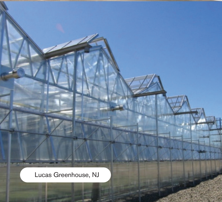
Lucas Greenhouse, NJ