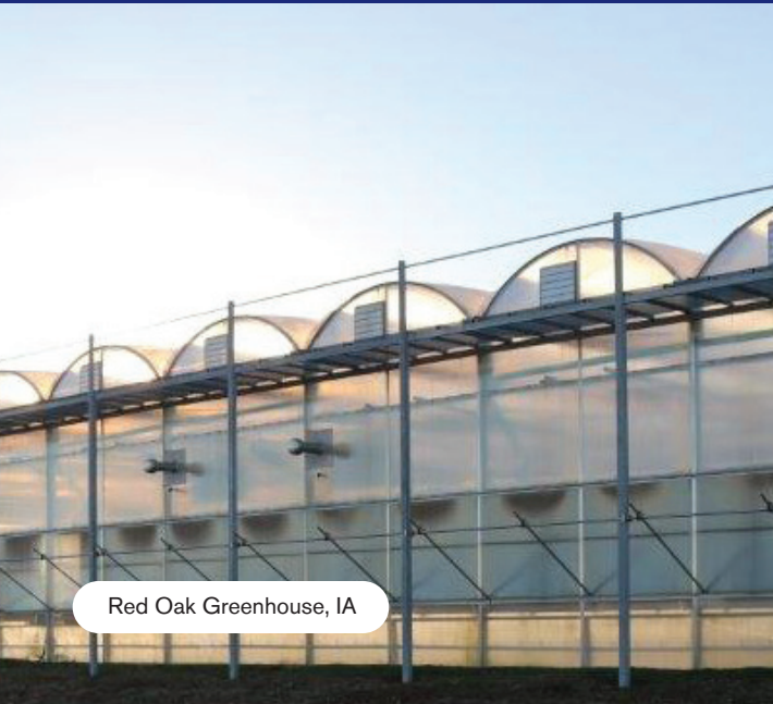
Red Oak Greenhouse, IA