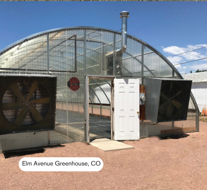
Elm Avenue Greenhouse, CO

The Zephyr is an ideal choice for natural ventilation and dehumidification. Its curved roof shape and peak vent allow heat to escape from the top of the house, eliminating the need for exhaust fans and vents, even with the gutters full of snow. Sidewall heights leave ample room for equipment such as booms, shade systems, and hanging baskets. The curved truss design gives you the flexibility to start with a poly-film covering and retrofit to a hard covering later.