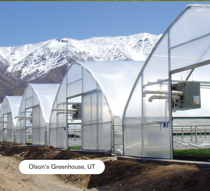
Olson's Greenhouse, UT

The Grand Teton is a great production greenhouse with high overhead clearance for hanging baskets and equipment. This house is the perfect solution for growers seeking a pad-wall and fan style growing environment, or for those who want to start with a poly-film covering and later convert to a rigid covering without major renovations.