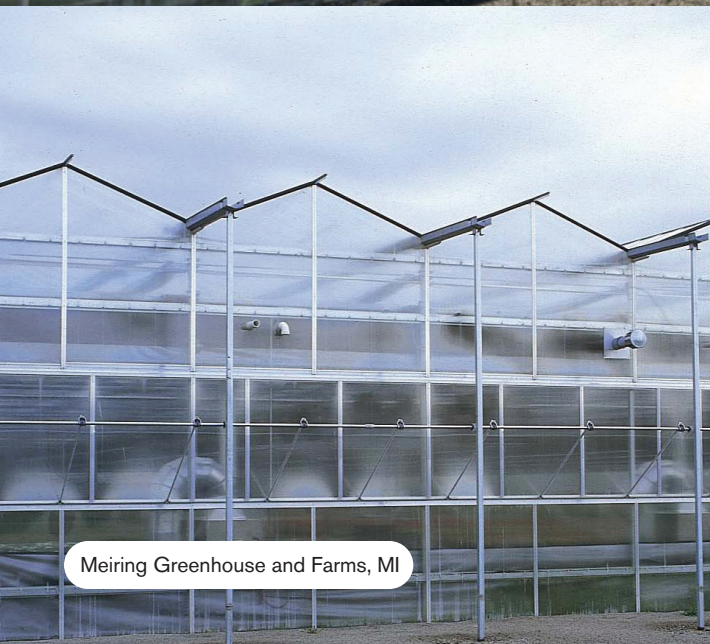
Meiring Greenhouse and Farms, MI