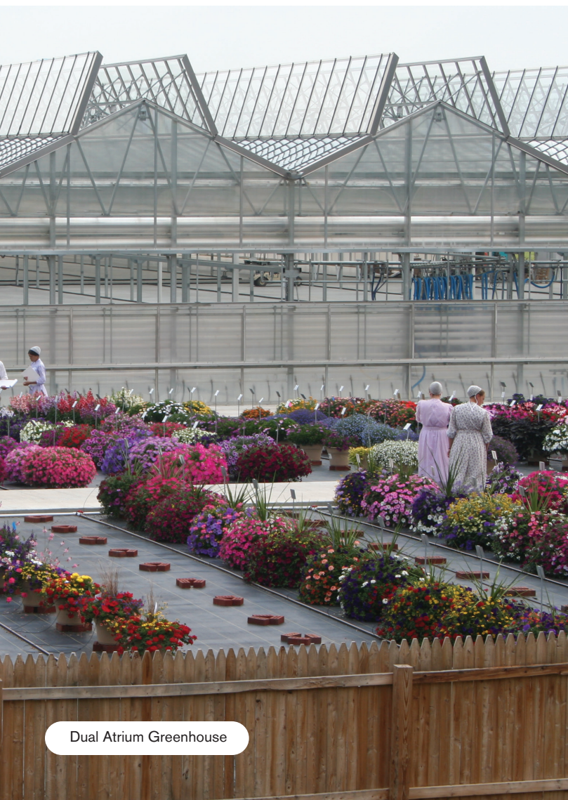
Dual Atrium Greenhouse