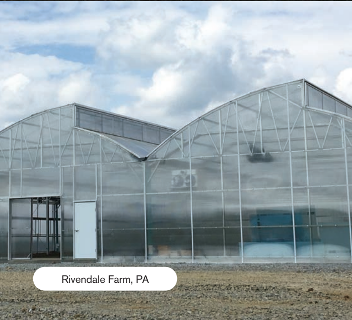
Rivendale Farm, PA

Whether used for production or retail, the Multi-Peak Poly-Arch greenhouse offers maximum airflow and cooling. A large, continuous ridge vent runs the full length of the house to allow trapped air to escape. The structure accommodates passive and/or mechanical ventilation and is an obvious choice for large-scale facilities that require a controlled growing environment for production.