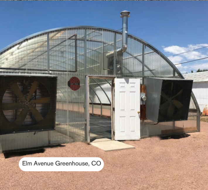
Elm Avenue Greenhouse, CO

The Zephyr is an ideal choice for natural ventilation and dehumidification. Its curved roof shape and peak vent allow heat to escape from the top of the house, eliminating the need for exhaust fans and vents, even with the gutters full of snow. Sidewall heights leave ample room for equipment such as booms, shade systems, and hanging baskets. The curved truss design gives you the flexibility to start with a poly-film covering and retrofit to a hard covering later.