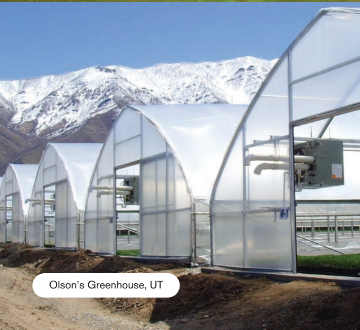
Olson's Greenhouse, UT

The Grand Teton is a great production greenhouse with high overhead clearance for hanging baskets and equipment. This house is the perfect solution for growers seeking a pad-wall and fan style growing environment, or for those who want to start with a poly-film covering and later convert to a rigid covering without major renovations.