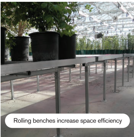
Rolling benches increase space efficiency