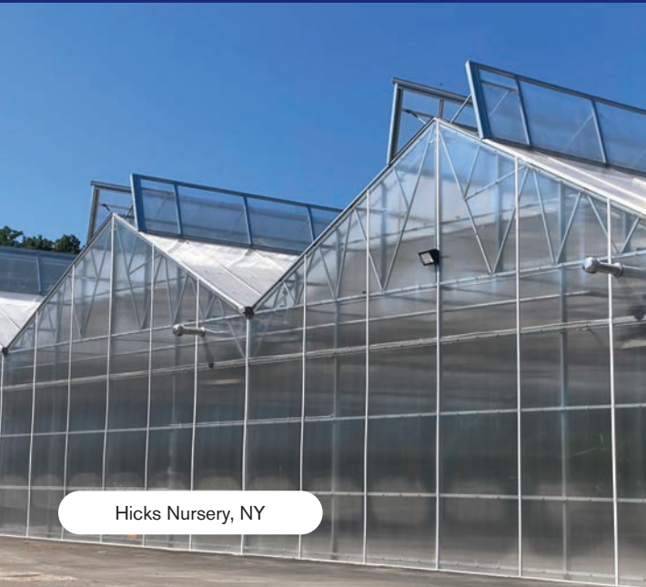
Hicks Nursery, NY