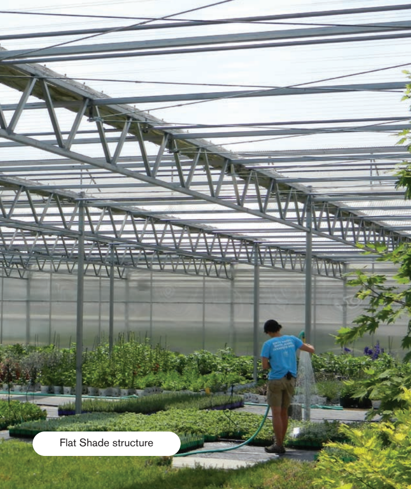
Flat Shade structure