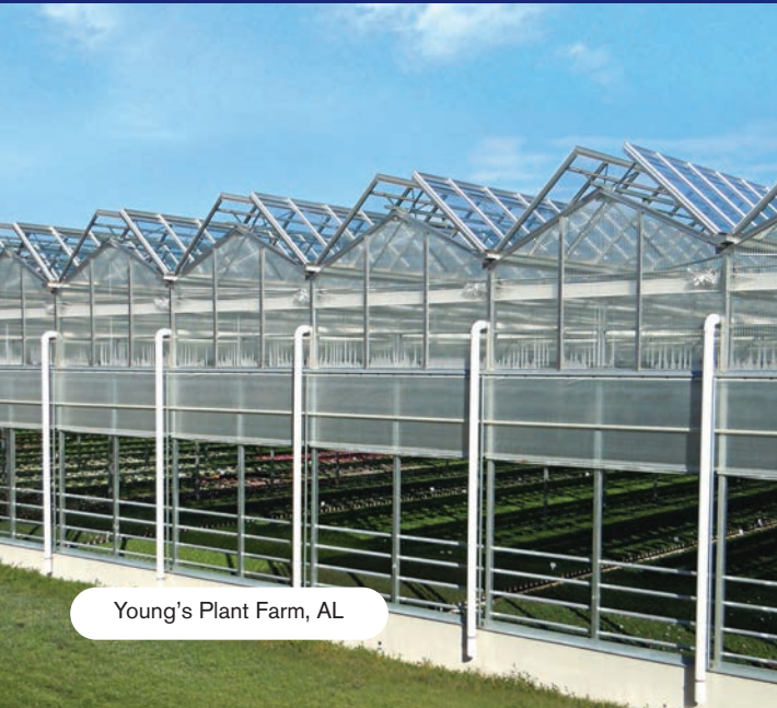
Young's Plant Farm, AL