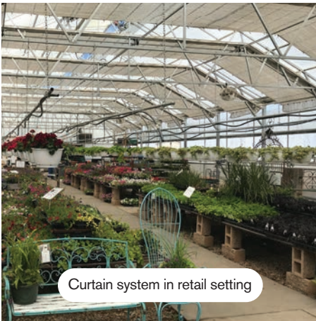
Curtain system in retail setting