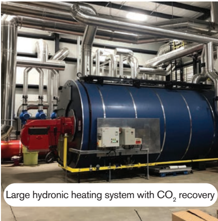
Large hydronic heating system with CO 2 recovery

Our in-house design and engineer experts consider factors such as crop, location, climate, production needs, and growing style to recommend an integrated greenhouse design to suit your unique needs. By seamlessly integrating automated systems, we enhance control and efficiency to help you optimize your climate, produce high-quality crops, and maximize your throughput and profits.