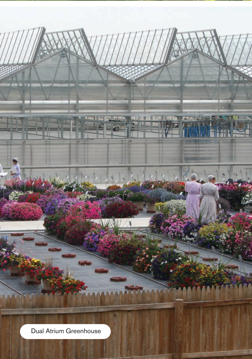
Dual Atrium Greenhouse