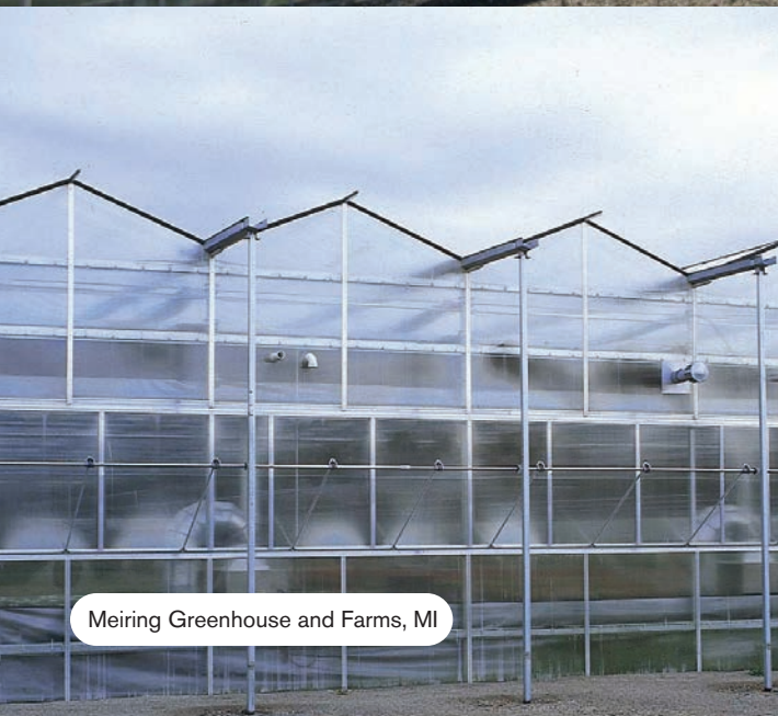
Meiring Greenhouse and Farms, MI