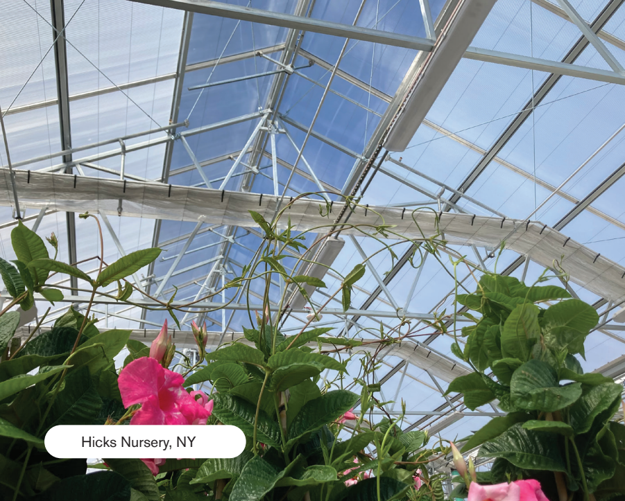
Hicks Nursery, NY