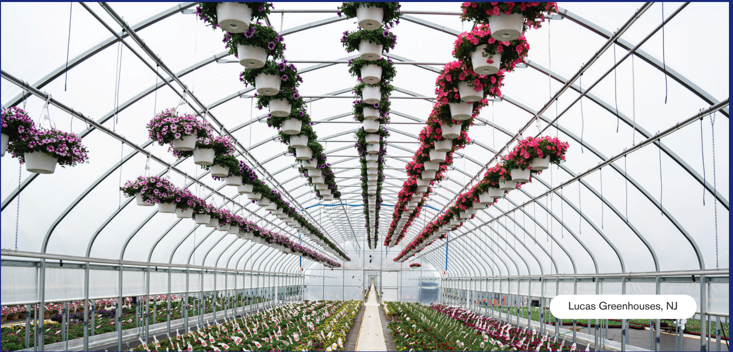
Lucas Greenhouses, NJ