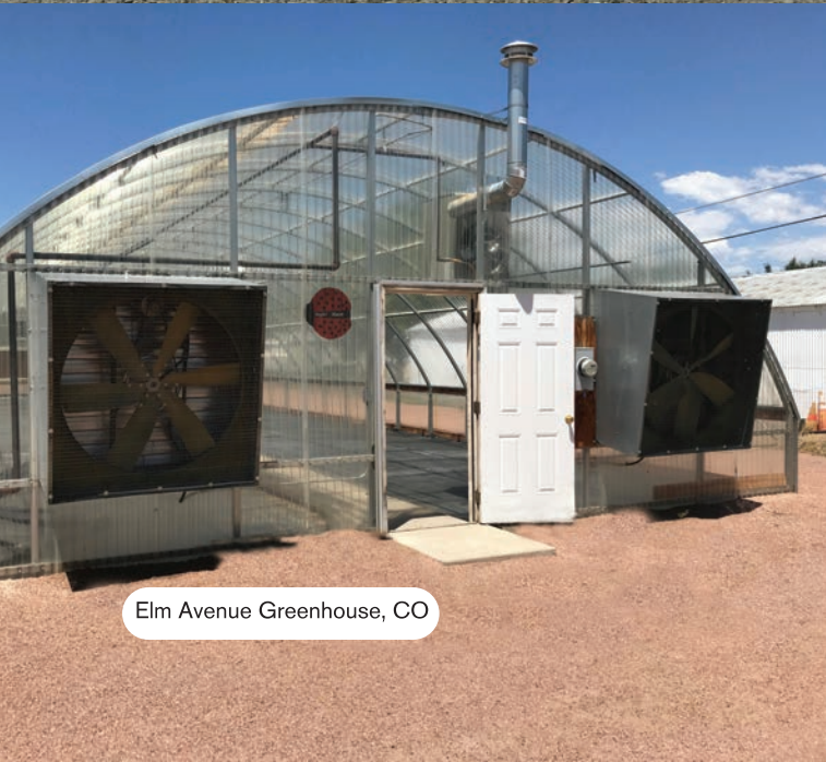
Elm Avenue Greenhouse, CO

The Zephyr is an ideal choice for natural ventilation and dehumidification. Its curved roof shape and peak vent allow heat to escape from the top of the house, eliminating the need for exhaust fans and vents, even with the gutters full of snow. Sidewall heights leave ample room for equipment such as booms, shade systems, and hanging baskets. The curved truss design gives you the flexibility to start with a poly-film covering and retrofit to a hard covering later.