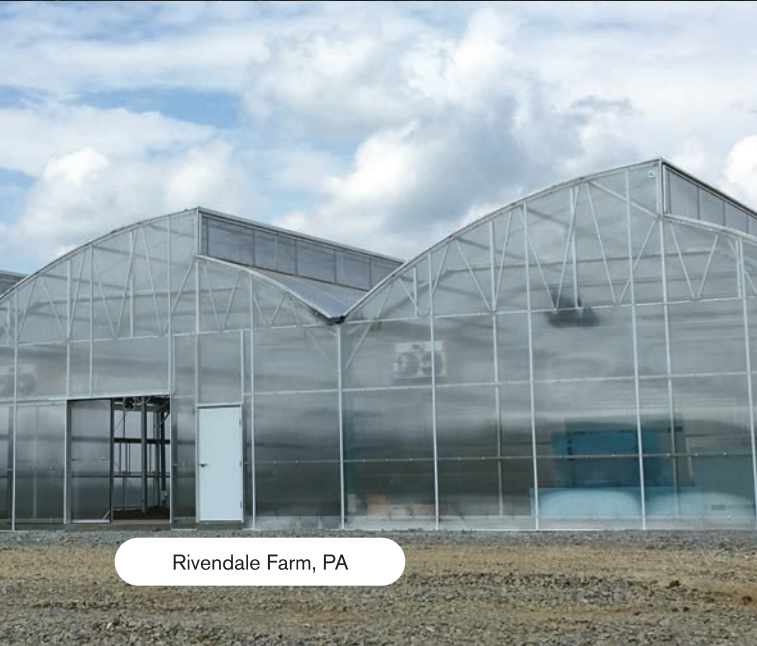
Rivendale Farm, PA

Whether used for production or retail, the Multi-Peak Poly-Arch greenhouse offers maximum airflow and cooling. A large, continuous ridge vent runs the full length of the house to allow trapped air to escape. The structure accommodates passive and/or mechanical ventilation and is an obvious choice for large-scale facilities that require a controlled growing environment for production.