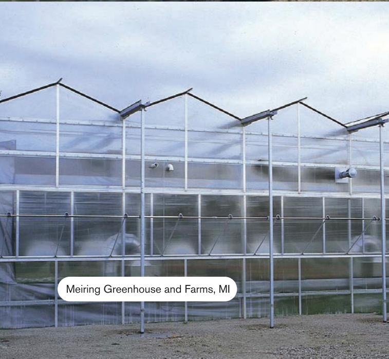
Meiring Greenhouse and Farms, MI