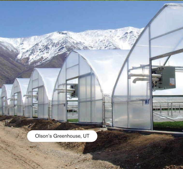
Olson's Greenhouse, UT

The Grand Teton is a great production greenhouse with high overhead clearance for hanging baskets and equipment. This house is the perfect solution for growers seeking a pad-wall and fan style growing environment, or for those who want to start with a poly-film covering and later convert to a rigid covering without major renovations.