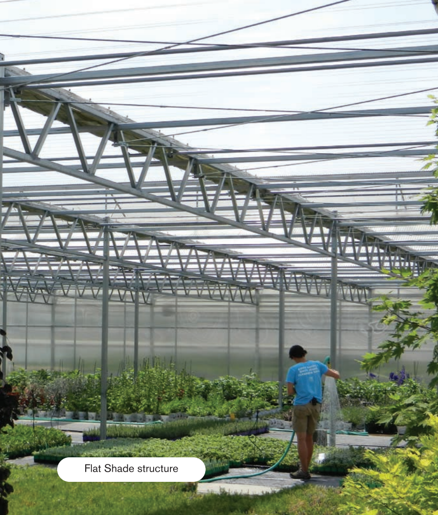
Flat Shade structure