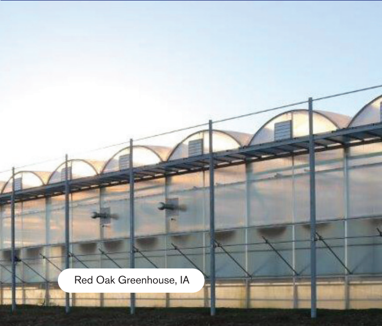
Red Oak Greenhouse, IA