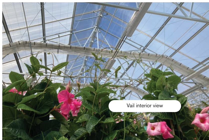
Vail interior view