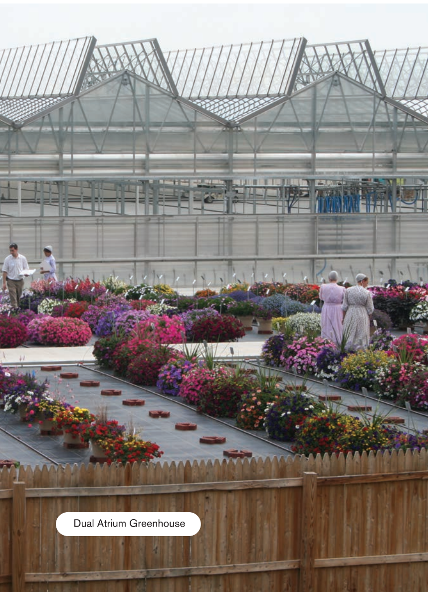
Dual Atrium Greenhouse