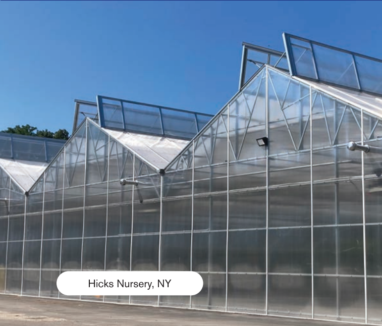
Hicks Nursery, NY