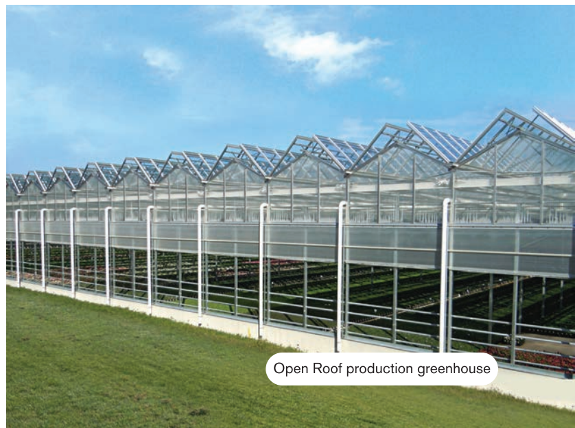
Open Roof production greenhouse