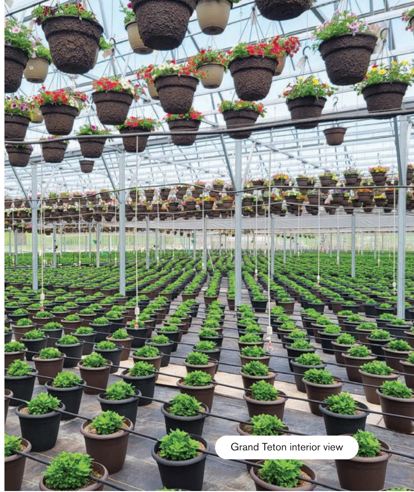
Grand Teton interior view