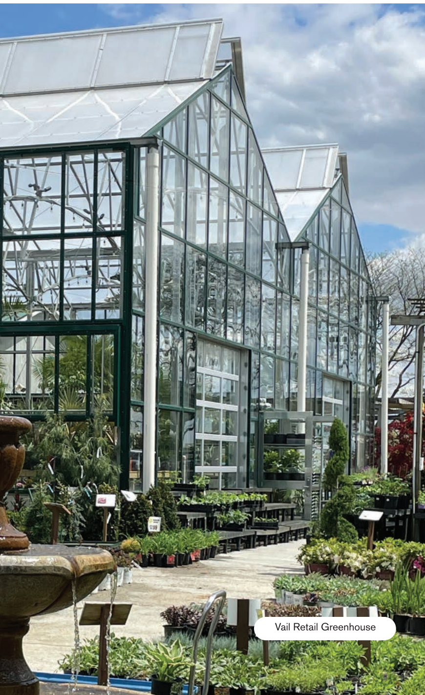
Vail Retail Greenhouse

Prospiant is the largest North American provider of complete commercial greenhouses and growing equipment. With a comprehensive suite of greenhouse structures and services, we meet all your greenhouse needs.