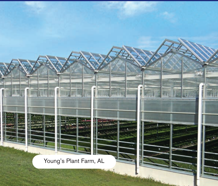
Young's Plant Farm, AL