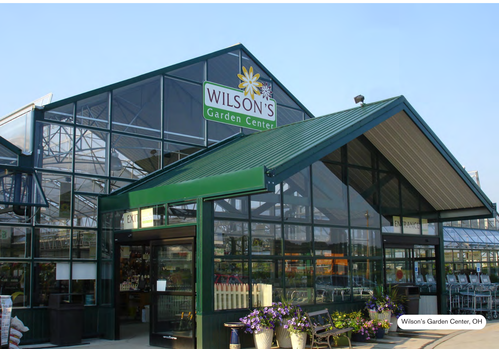
Wilson's Garden Center, OH