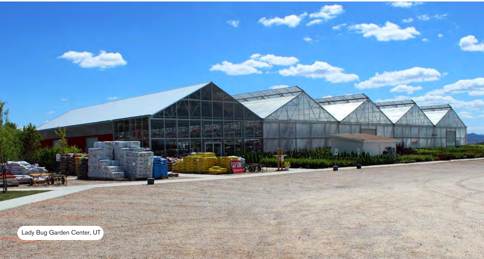
Lady Bug Garden Center, UT