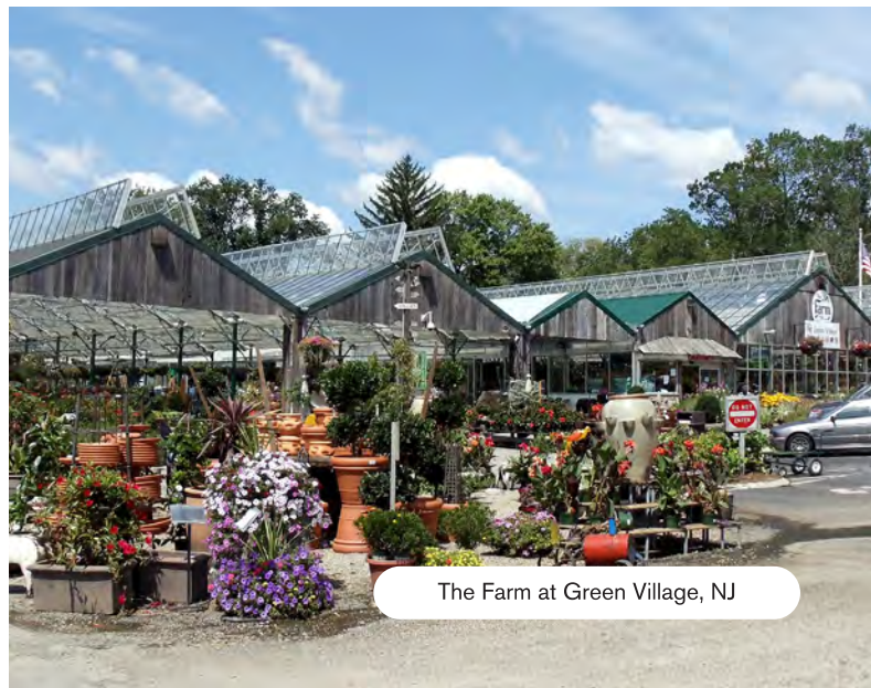
The Farm at Green Village, NJ