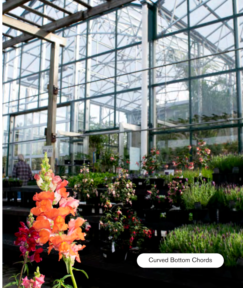
Curved Bottom Chords