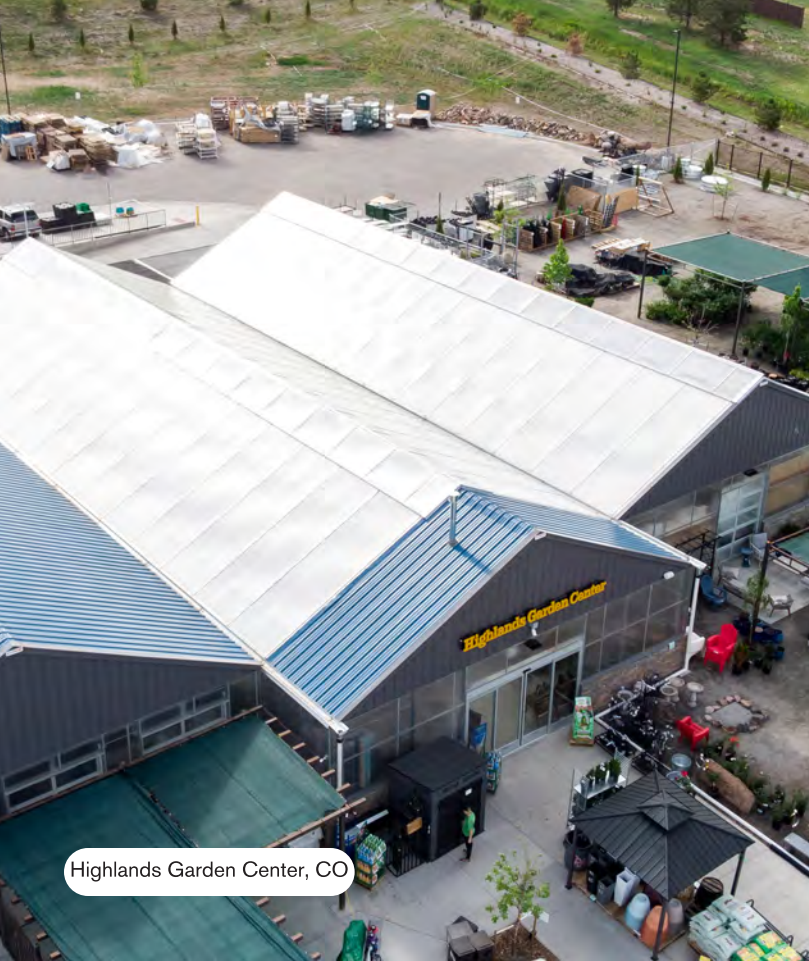
Highlands Garden Center, CO