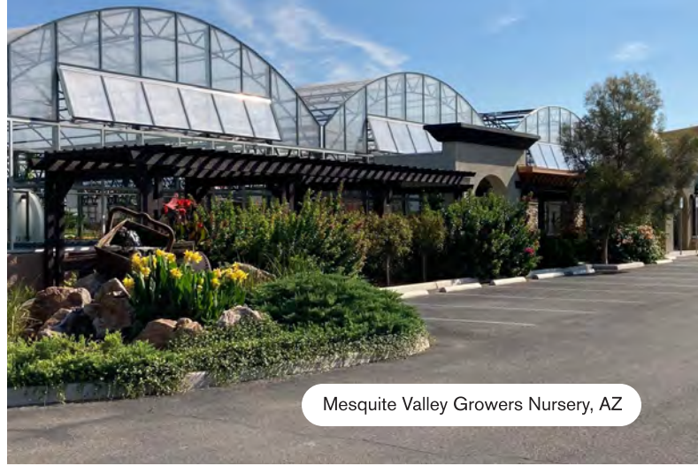
Mesquite Valley Growers Nursery, AZ

With our extensive experience in designing and building retail garden centers, we engineer the ultimate retail space for you. Whether you want to create a cohesive brand image across multiple stores or make a bold statement with a unique garden center, let Prospiant bring your vision to life.