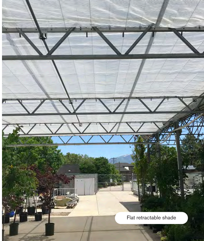
Flat retractable shade