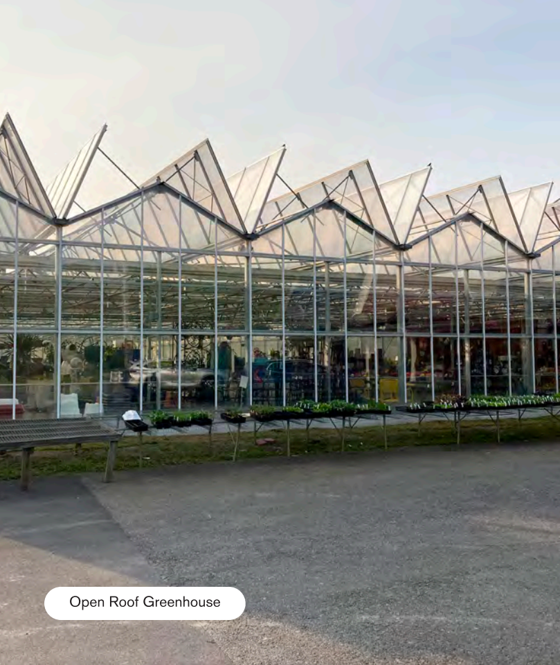
Open Roof Greenhouse