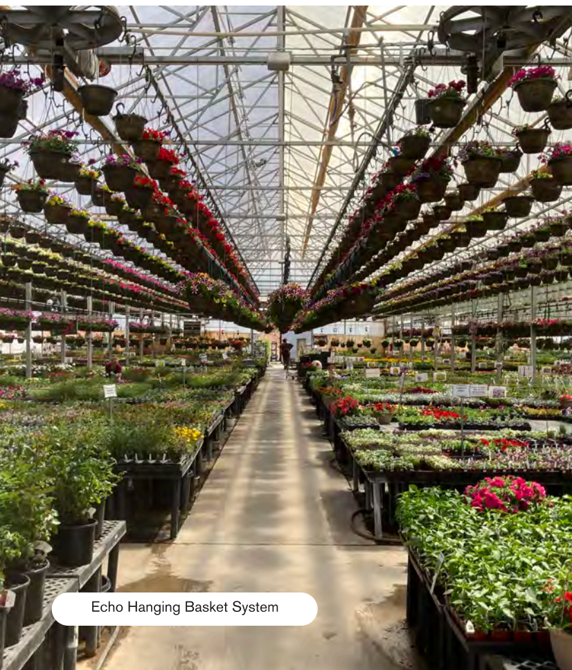
Echo Hanging Basket System