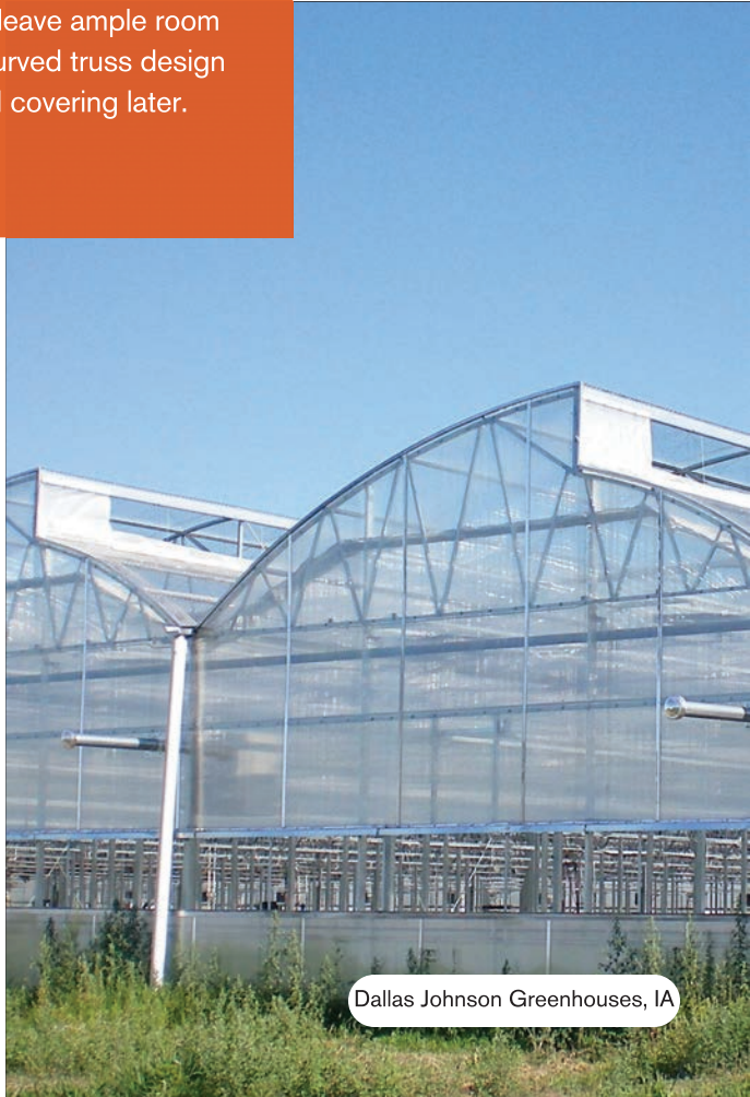
Dallas Johnson Greenhouses, IA