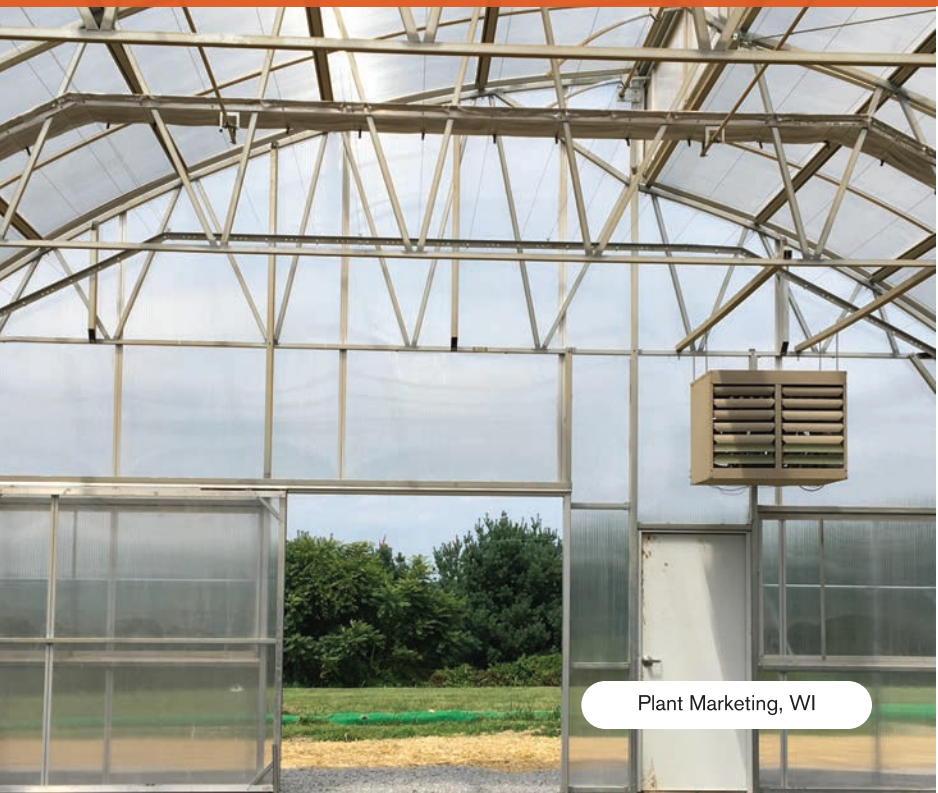
Plant Marketing, WI