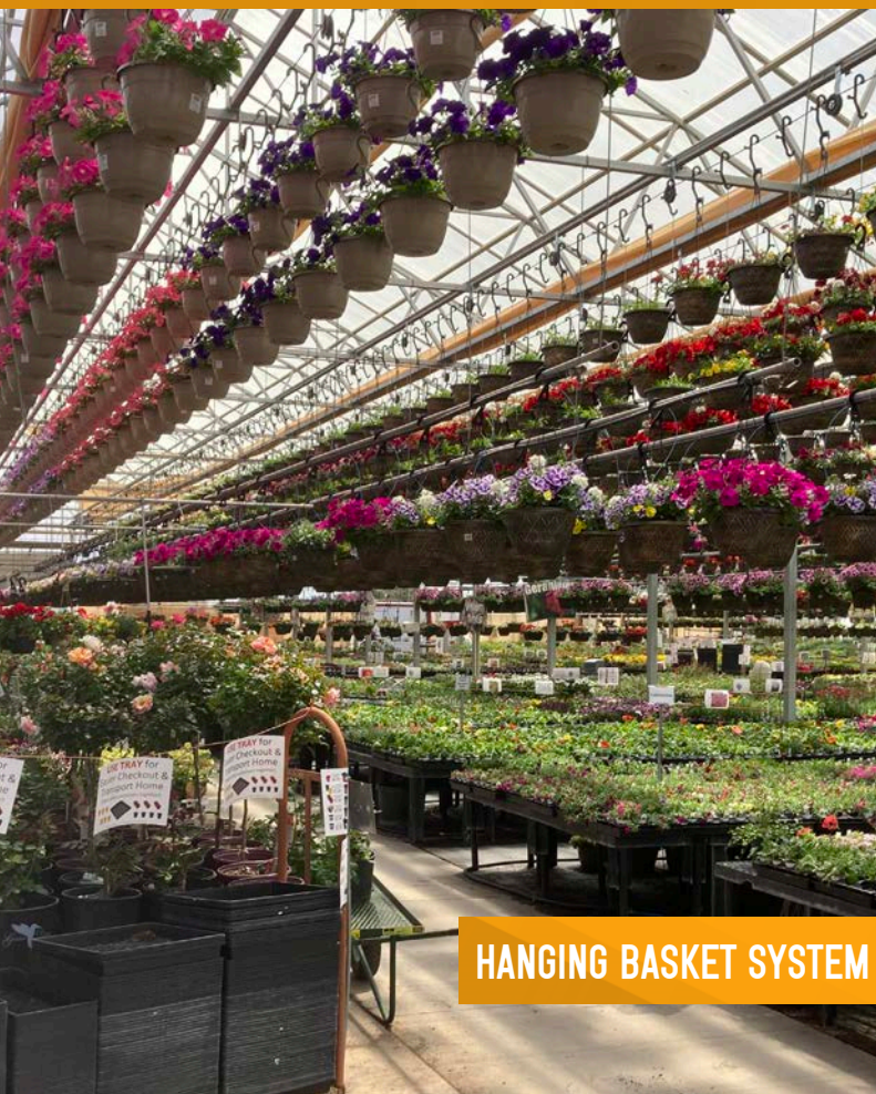
HANGING BASKET SYSTEM