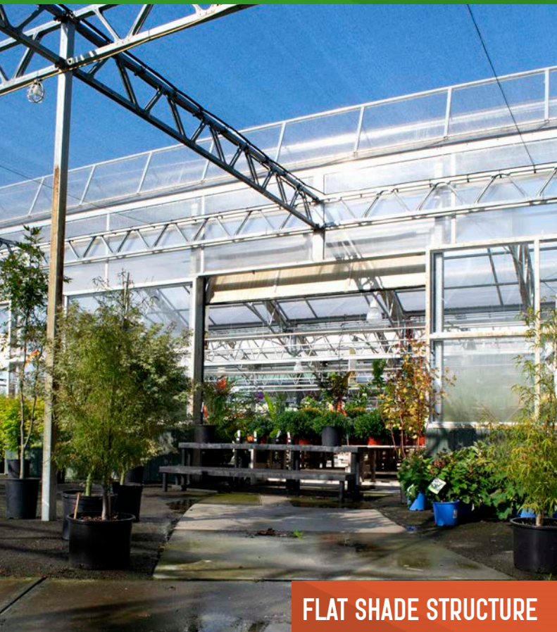
FLAT SHADE STRUCTURE